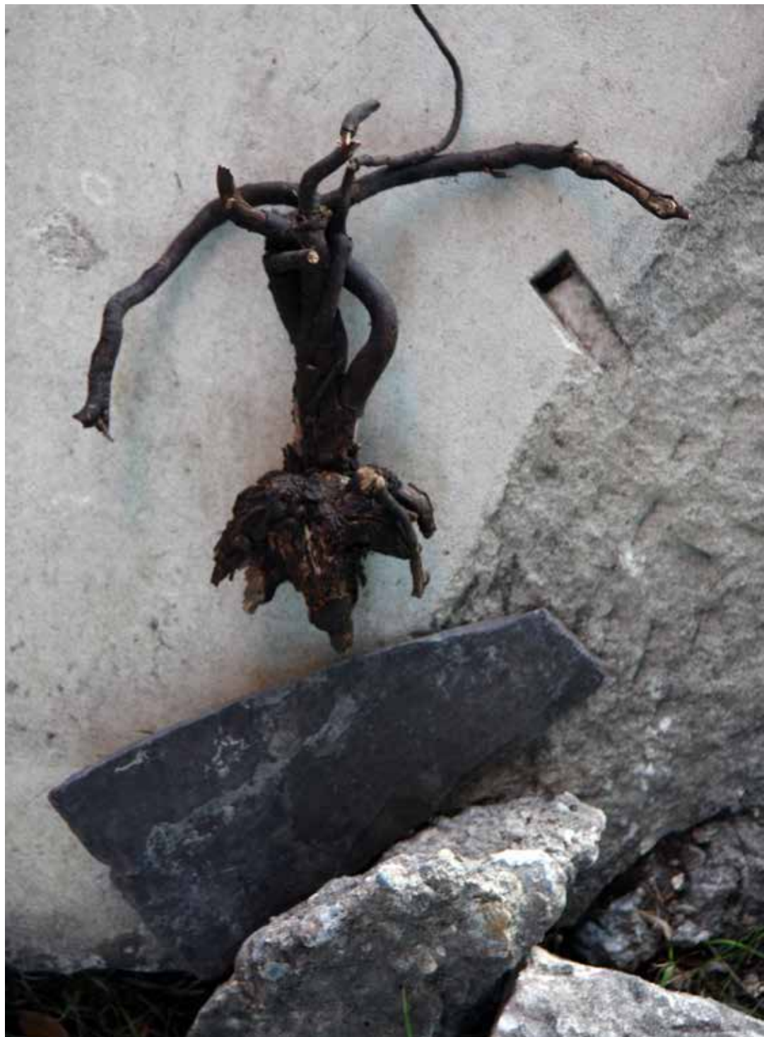
37. The committee of urban shamanism is comprised of Shakespeare's falcon, Blake's tiger, Rimbaud's toad, Yeats' swan.