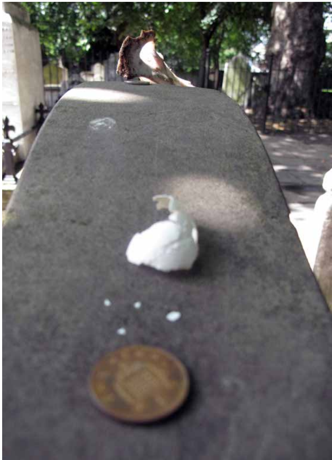
23. Poetry should be numerological as well as numerical.