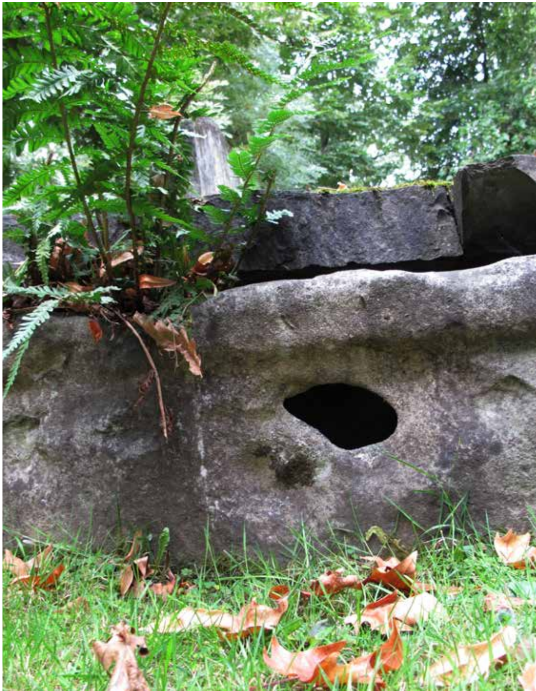
32. Urban shamanism welcomes the Transition Town movement to the urban centres, and looks to the greening of the city. Ecopoetry, a fusion of nature poetry and political poetry, can also be urban. (Further reading: 'Living in Falmouth' by Peter Redgrove).